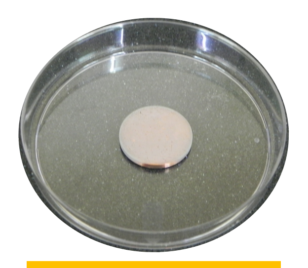
Cd deposition at 100 µm