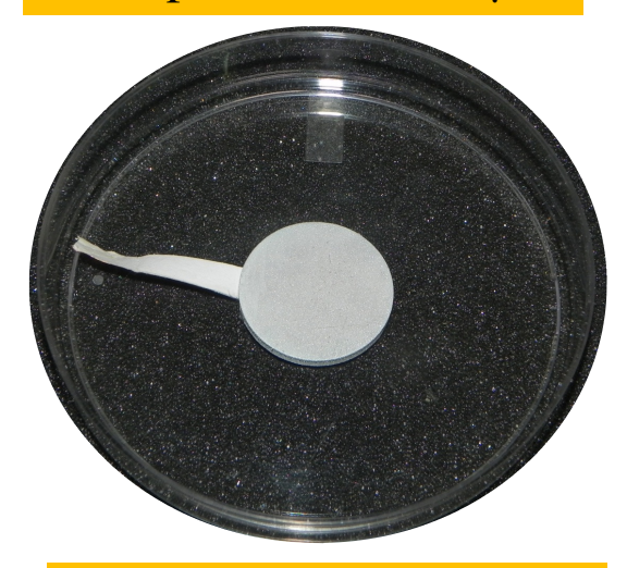
Cd deposition at 200 µm