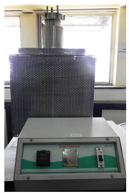
Photograph of the setup