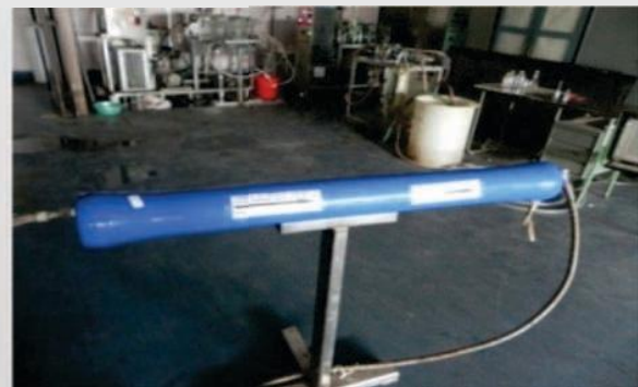
Spiral modules of charged nanofiltration membranes