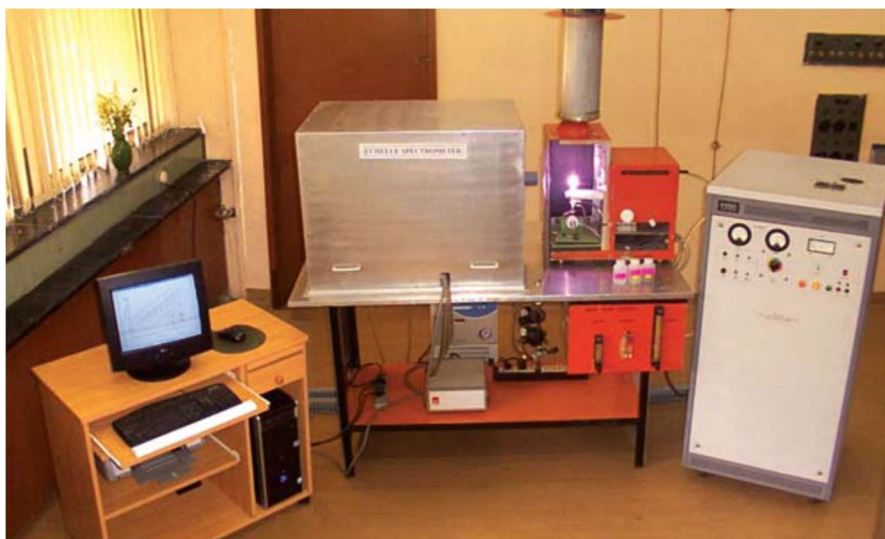
Fig. 5: Photograph of echelle spectrograph coupled to an ICP torch assembly, with an RF generator (27.2 MHz, 1.5 kW)

The instrument has been designed (Fig. 6) to consist of two concave spherical mirrors, an echelle grating having frequency of 79 lines/mm, and a CCD detector (of size 13.3 mm X 13.3 mm) for recording the spectral lines in two-dimensional format. Fused silica Littrow prism is used to sort the different spectral orders to avoid their overlapping in the focal plane of the instrument. The focal lengths for the collimating mirror and focusing mirror have been calculated to be 250 mm and 175 mm respectively. The reciprocal linear dispersion of the instrument is 3.49 \text{ \AA/mm} for a grating of 79 g/mm and at a wavelength of 3000 \text{ \AA} for a diffraction order of 81. The spectral range of the instrument is 2000 - 4000 \text{ \AA} with a wavelength resolution of 0.15 \text{ \AA} at 3000 \text{ \AA} . Fig. 7 shows the emission spectra recorded by introducing a 500 \text{ \mu g/ml} tungsten aqueous solution, into the ICP torch. A calibration plot as recorded for some elements been shown in Fig. 8.