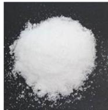
Zinc Sulphate 22% Zn