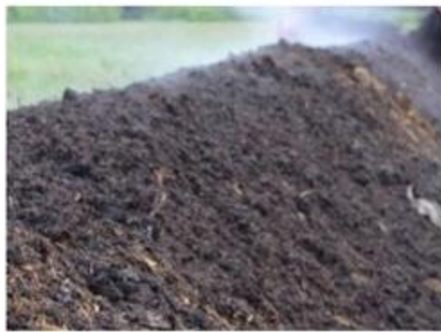
Sugarcane industry Sludge