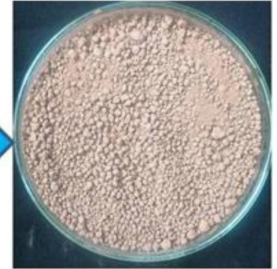
New Zinc fertilizer 4-5% Zn