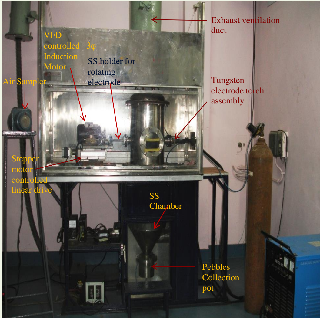
Rotating Electrode Process: Experimental Unit