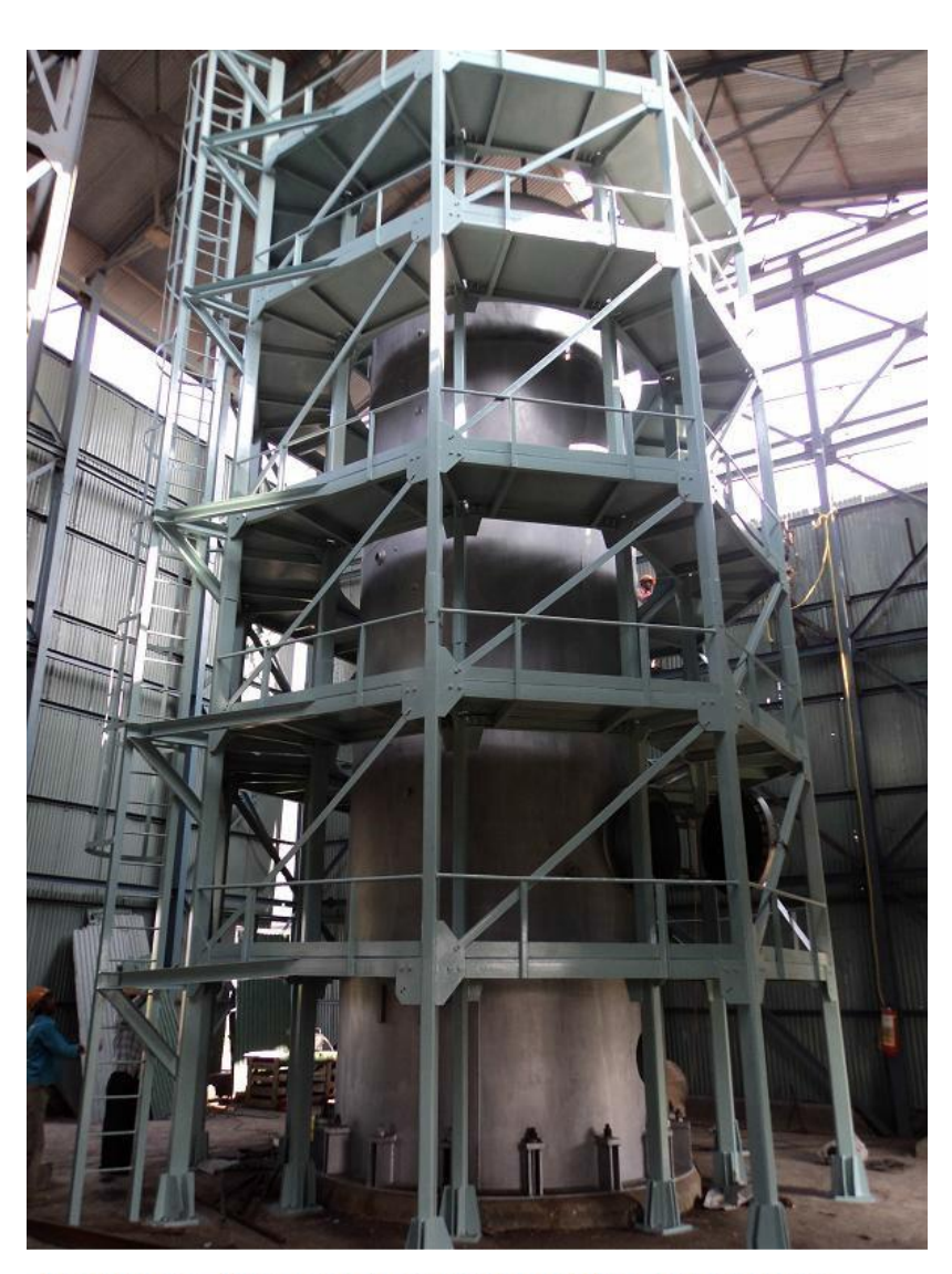
Hydrogen Recombiner Test facility at Tarapur