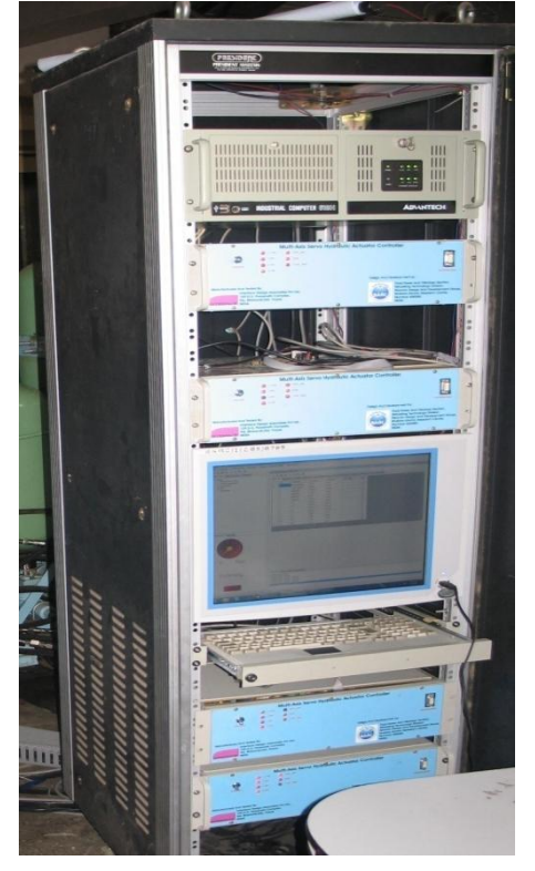
Multi-Axis Servo Controller