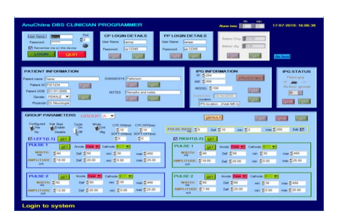
PC based Patient Programmer (PP) and Clinician Programmer (CP) software