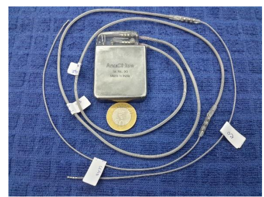
Implantable components: Pulse Generator (IPG), Brain Lead, Intermediate Lead

Deep brain stimulation (DBS) is used to treat a number of neurological conditions, such as Essential tremor, Parkinson's disease & Dystonia, by delivering carefully controlled electrical stimulation to precisely targeted areas of the brain responsible for motor function. It is being developed under MoU with SCTIMST, Thiruvananthapuram. The DBS system consists of implantable components (IPG, brain lead & intermediate lead) and external components (EIU, PP and CP). The IPG is implanted subcutaneously in the subclavicular or upper abdominal region. It is comprised of a battery and integrated circuits that are hermetically sealed in titanium enclosure. The IPG generates electrical stimulation pulses with a variety of parameters, modes, and polarities. Electrodes are placed on both sides of the brain for bilateral stimulation. Non-invasive adjustment of the stimulation parameters and wireless charging of IPG battery are achieved using the external components of the DBS. Prototypes of all the DBS system components have been designed and developed. Integrated testing of the system has been successfully carried out with the bio-simulator (PBS phantom solution) as load.