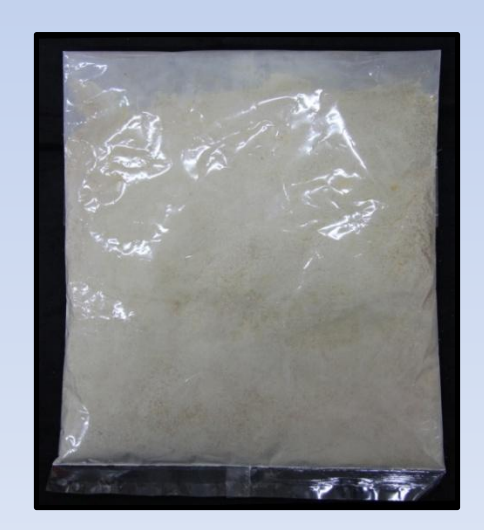
Xanthan gum production technology