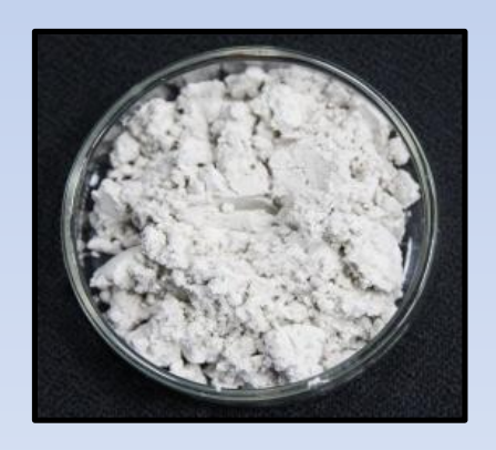
Radiation depolymerised guar gum for making encapsulated flavour powder (solid state)