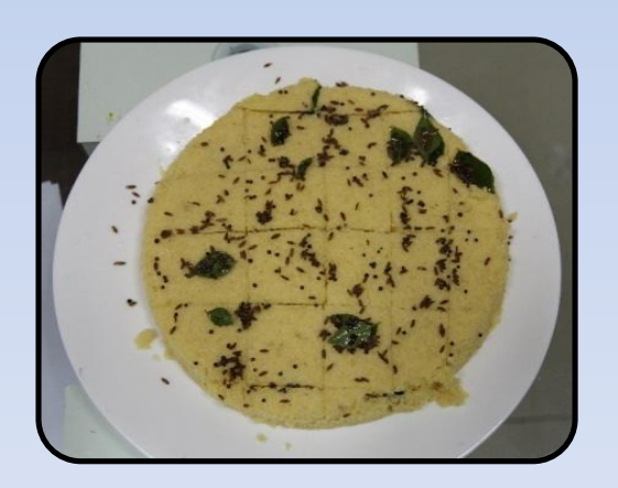
Psyllium (dietary fibre) fortified Dhokla