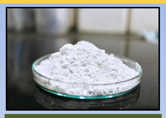
Oxocatalyzed biodegradable Films