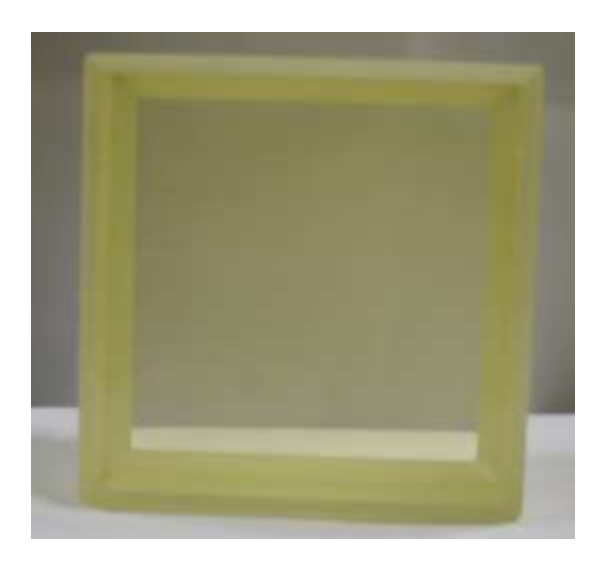
Lead Glass Slab Photograph suggesting visibility through glass

Whether the parent product/ technology/ process is patented: Yes/No No